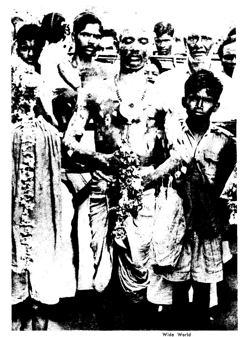
PENANCE — Body of devout Hindu in Madras, India, is pierced by shafts of tiny metal spears. Many today erroneously believe self-torture is pleasing to God and falsely assume fasting is penance.

COMMENT: In the Bible "fast" and "humble" often mean the same thing. Often it will be expressed "he humbled himself before God." This means that he fasted before God! So when you see the command to humble yourself, it usually means to fast .