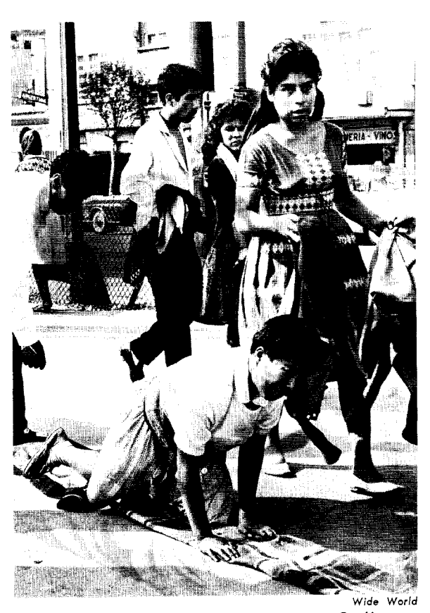
Penance of any kind is loathsome to God!

COMMENT: God will not hear their prayers because they are not willing to put sin out of their lives. They want the blessings of God without putting out the very agent — SIN — that cuts them off from God and brings CURSES upon them!